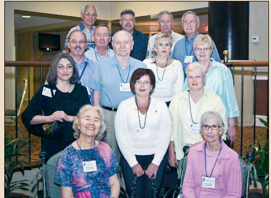
The 2008 Willow Valley Prophecy Conference—a time for Canadians to meet new friends, enjoy fellowship and outstanding Bible teaching. Plan to join us next year!

instead of shame you shall have double honor, and instead of confusion they