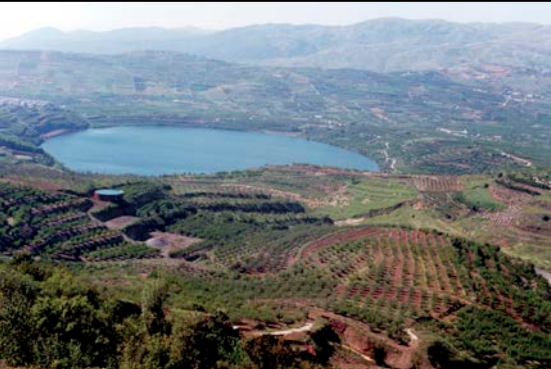
Birket Ram Lake and orchards, Golan Heights

Land of Israel after this third and final dispersion at the end of the age that will be so spectacular, it shall no more be said, the Lord lives who brought up the children of Israel from the land of Egypt, but, the Lord lives who brought up the children of Israel from the land of the north and from all the lands where He had driven them. For I will bring them back into their land which I gave to their fathers " (Jer.16:14-15).