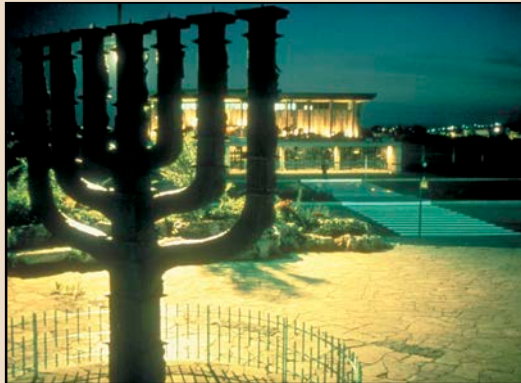
Knesset and the menorah illuminated at night, Jerusalem

Unfortunately, bad theology does not always go away just because it contradicts God's Word