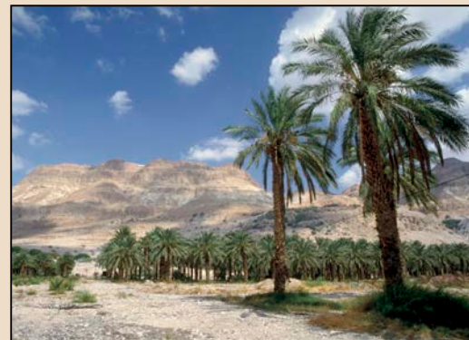
Ein Gedi date groves

Thus says the Lord, Who gives the sun for a light by day, the ordinances of the moon and the stars for a light by night, Who disturbs the sea, and its waves roar (The Lord of Hosts is His name); "If those ordinances depart from before Me, says the Lord, then the seed of Israel