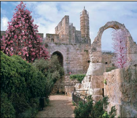
Glass art works by Dale Chihuly in the Tower of David Museum, Jerusalem

teaching in the New Testament plainly communicates Israel's continued viability. Paul's intent cannot be misconstrued: