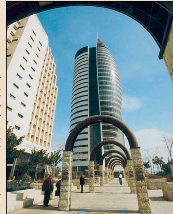
The government building in downtown Haifa

God clearly states this transformation will take place when Israel returns, to Me with their whole heart (Jer.24:7). Zechariah foresees the day Israel recognizes Messiah and elab-