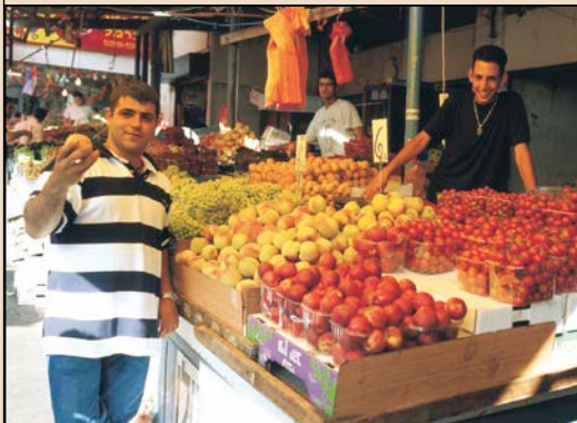
Tel Aviv fruit market

As Ezekiel obeys God's command to proph-