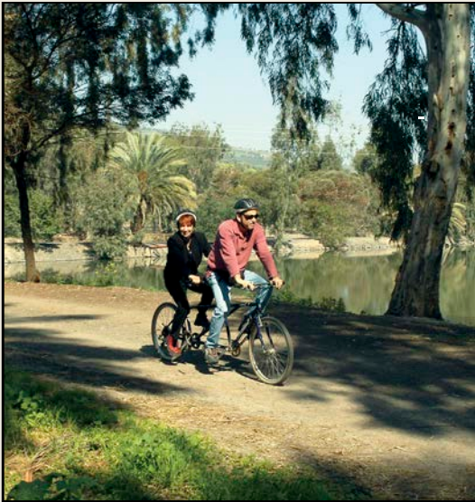
Tandem-cycling in Galilee

Actually, God does care. As the executor of a covenant promising a specific land to Abraham and his descendents forever, God explicitly