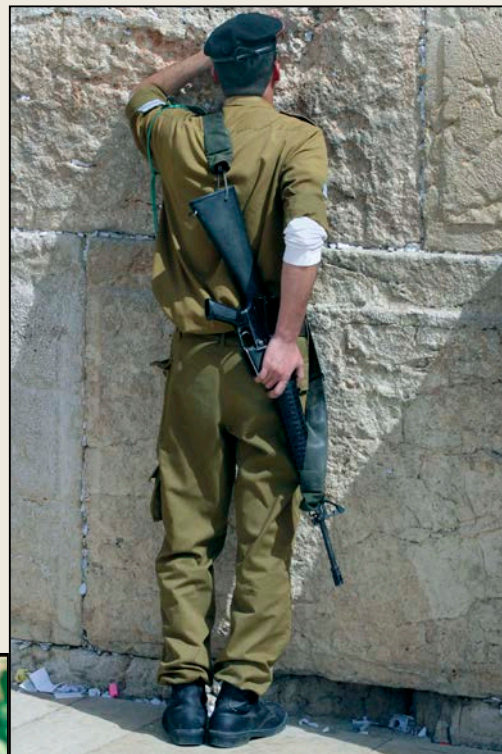
Soldier at Western Wall

There is no ambiguity in God's promise. The land of Israel belongs to the Jewish people, and His plan does not include abandoning it for any other geographic location no matter how attractive—including the Baja Peninsula.