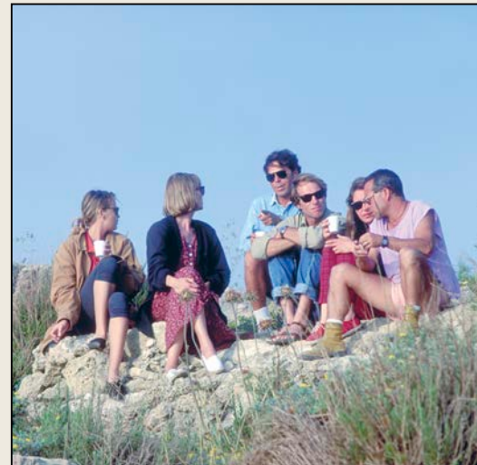
Friends picnicking in the hills