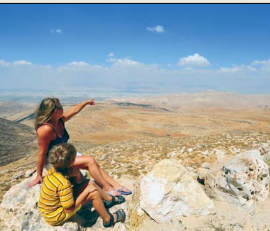
Viewing Judean mountains

Israel’s return is certain with the prophets suggesting a homecoming in incremental stages. 2 The impetus